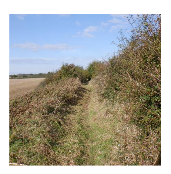
Near Denges Barn: Photo contributed by R. Boulter

WSCC PROW team, their contractors, our workday volunteers, and our Facebook members all contributed to a very significant improvement of the old towpath stretch from Drove Lane to Tile Barn Farm. Thanks!